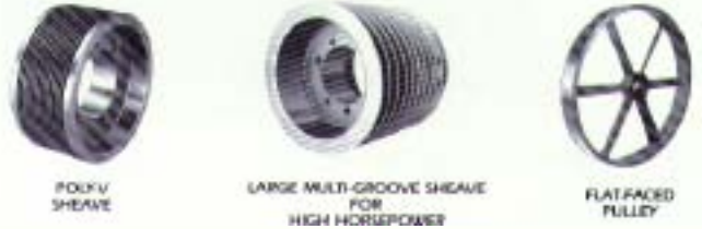
POLY V SHEAVE