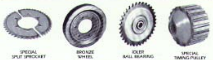
SPECIAL SPLIT SPROCKET