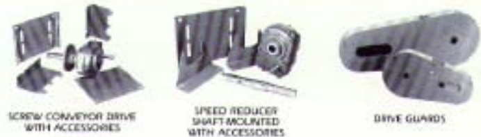
SCREW CONVEYOR DRIVE WITH ACCESSORIES