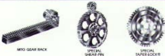
MTO GEAR RACK