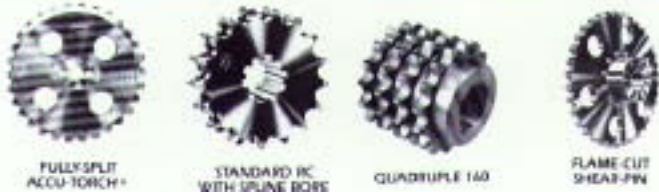
FULLY SPLIT ACCU-TORCH®