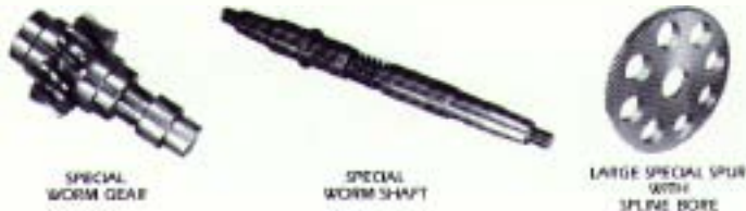
SPECIAL WORM GEAR